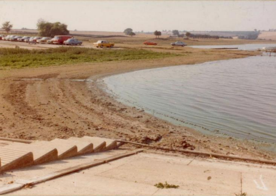
Water Level - OD Liverpool 210.09 ft.