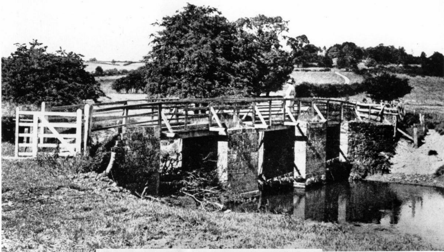
Reproduction of a photograph of the Stoke Dry footbridge before the Eye Brook Reservoir was built. Original photograph in 'Country Life' dated 23rd December, 1939.