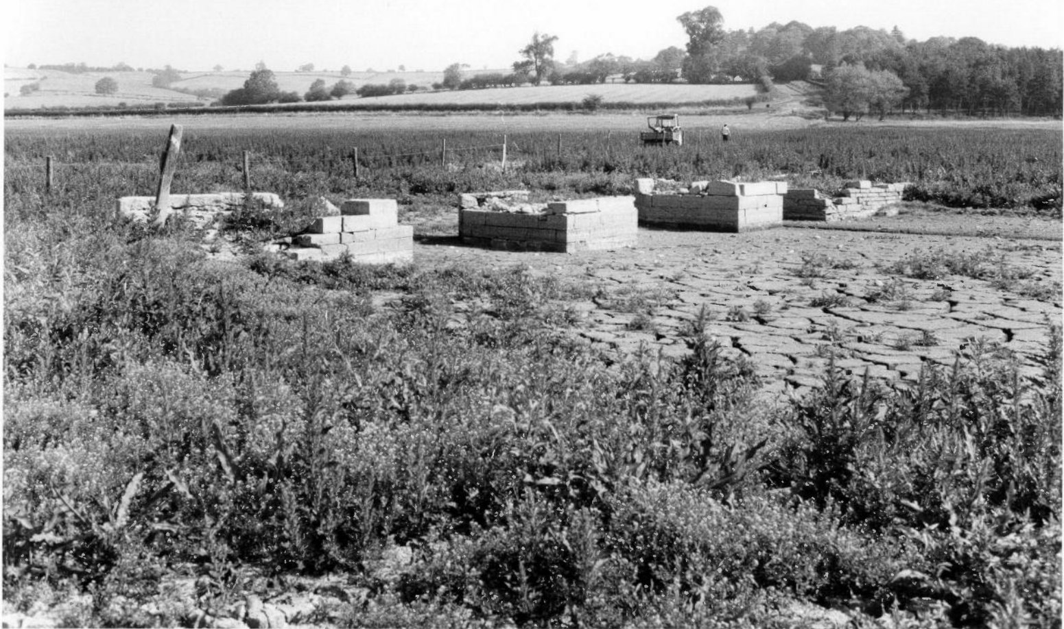
Remains of Stoke Dry Footbridge August 1976. The view is taken from virtually the same position as photograph above.