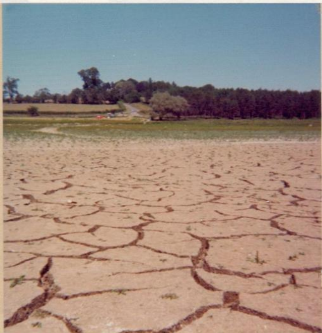
Taken from the Old Bridge