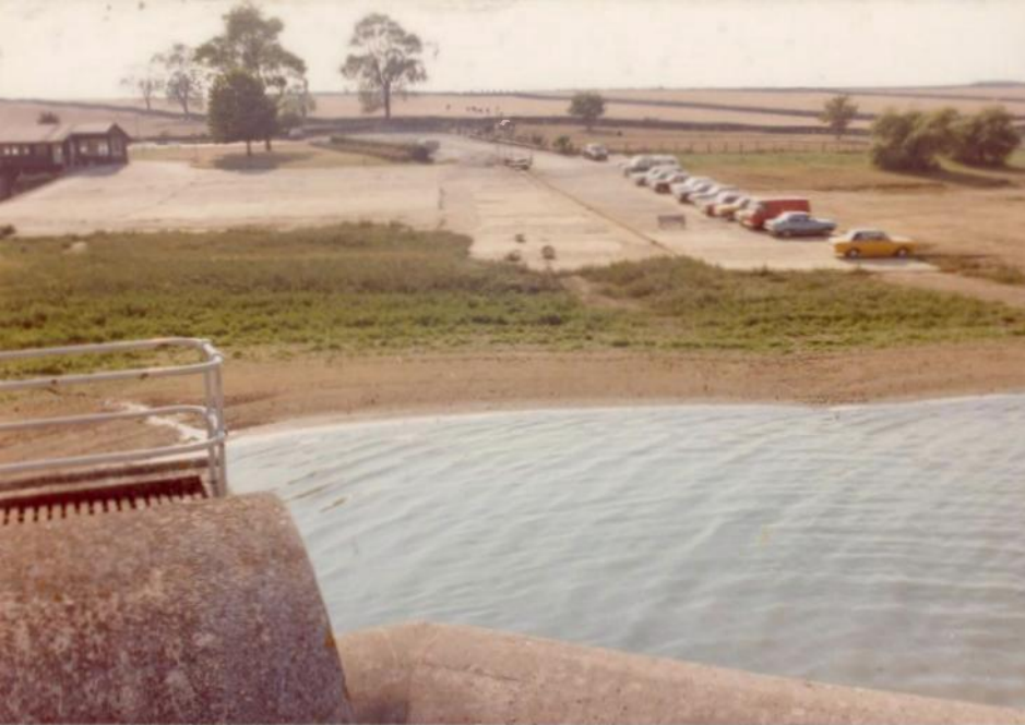
Water Level - OD Liverpool 210.09 ft.