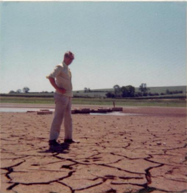
Exposed stone work of old bridge