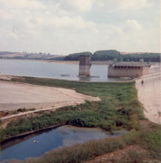
Views of concrete hard and weed growth between the hard and the dam